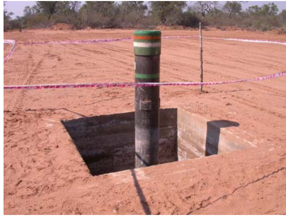
The conductor pipe drilled and cemented 150 meters into the ground and the 2m deep drill cellar ready for the drill rig to set up at the twin well to the Independencia 1 well