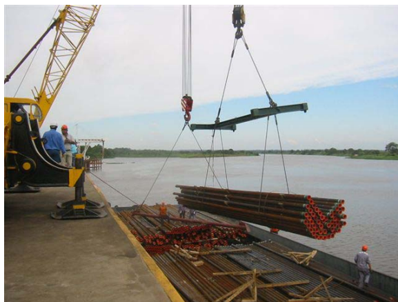
Drill casing being unloaded from the river barge for loading onto trucks and hauling to the logistics base at La Patria at the end of the paved highway, near the center of the Boqueron Block