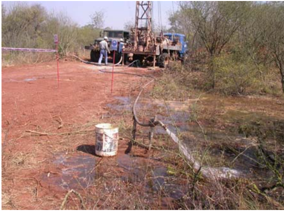
Testing the water well for supplying water to drill the twin well to the Independencia 1 well on the Gabino Mendoza Block