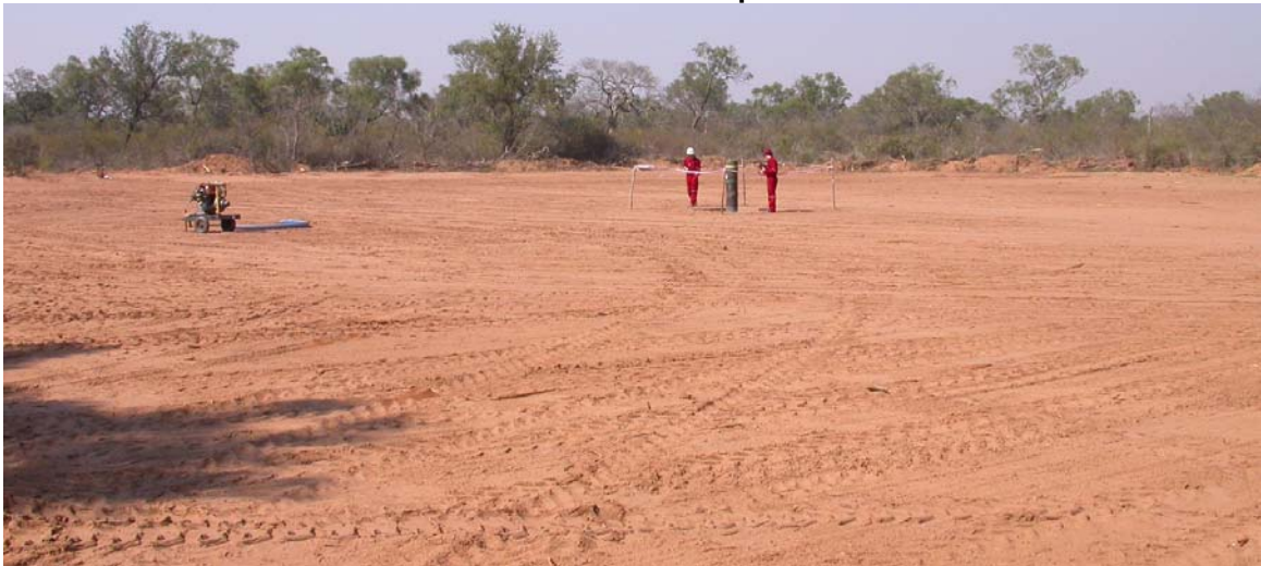
The drill pad cleared and graded, ready for the drill rig and man camp at the Independencia 1 well site on the Gabino Mendoza Block