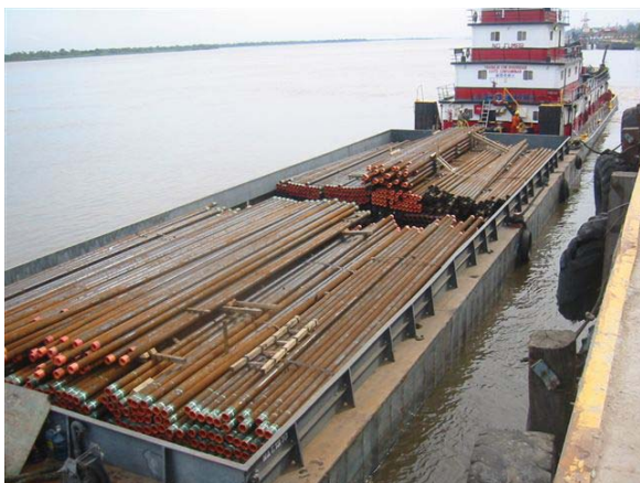
Drill casing from Houston arriving at the river port in Asuncion, the capital of Asuncion